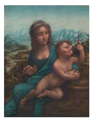
Art diagnostics

The Standard series of ImSpectors are basic imaging spectrographs designed for area scan cameras with 1/2" or 2/3" detectors. Standard series provides the smallest possible physical size and light weight with a small aberration, and high image throuhgput.